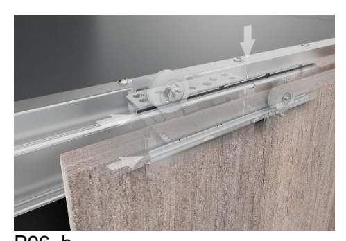
The working components used in TopLine L with split profiles are barely visible and silently move wardrobe doors across the profile joint.

Contact: Hettich Marketing und Vertriebs GmbH & Co. KG Anke Wöhler Gerhard-Lüking-Strasse 10 32602 Vlotho Tel.: +49 5733 798-879 anke.woehler@hettich.com