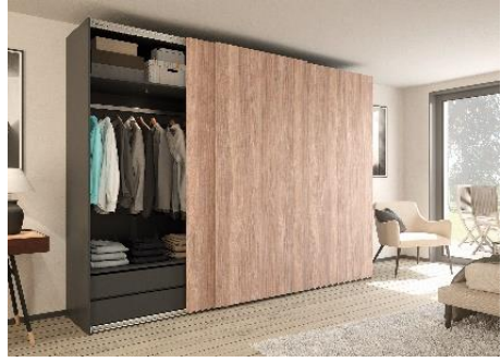
P96_a TopLine L with split profiles guarantees luxuriously smooth running performance even in ceiling height wardrobes with sliding doors weighing up to 50 kg each.