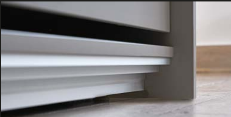
Aesthetic appeal all round: the bottom guide profile is set back beneath the base panel – almost hiding it from view.