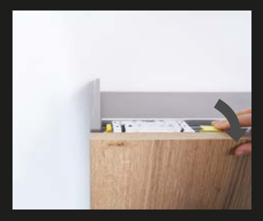
Perfect overlay adjustment: adjust door overlay by any amount with the door closed – for instantly visible results. Without any tools whatsoever.