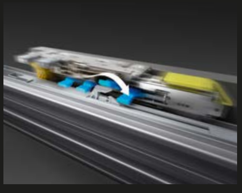
Incorrect installation ruled out:

ted in the end cap in the correct position. This reliably prevents any malfunctioning and damage to the system.