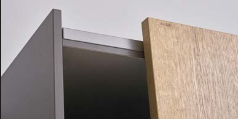
Elegant look from clip-on installation: ceiling height wardrobes without visible screws.