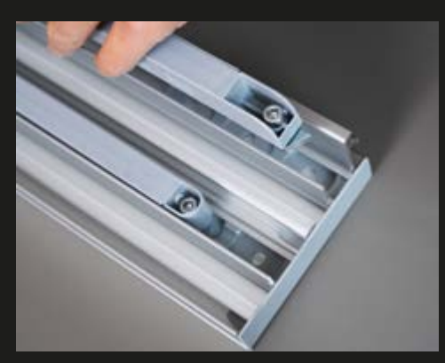
Silent System installation made easy:

calculating the position of the Silent System with complicated formulae and accurately measuring everything out – that was yesterday. The Silent System elements simply screw into the end cap – job done!!