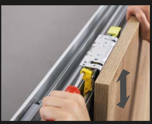
Straightforward height adjustment: the quickest way to adjust sliding doors is when they are closed. Door height is conveniently adjusted from the front and gap alignment can be checked straight away. Alternatively, ceiling height constructions are adjusted from the side.