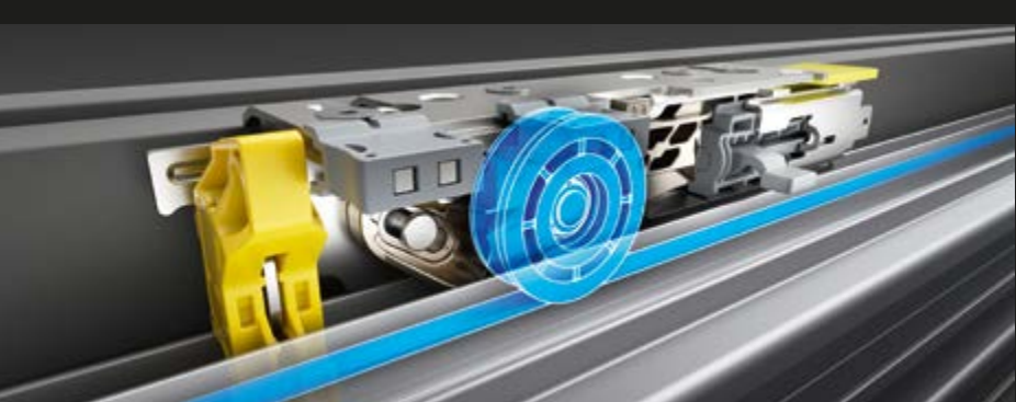
Smooth, quiet running action: the rollers continue to move in virtual silence even after prolonged periods out of use.