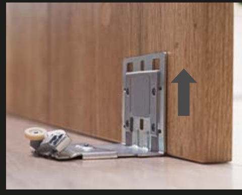
Innovative floor standing guard:

before fitting them, the doors can be set down on the floor without having to worry about damaging them. The bottom guide components then glide up automatically.